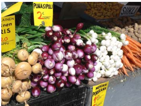
“Vegetable Market” Finland, 2005