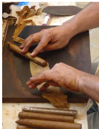
“The Cigar Roller” Costa Rica, 2010