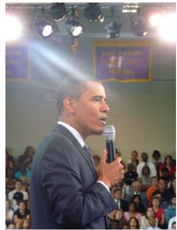
“Making his Pitch for Health Care Reform” Raleigh NC, July 2009