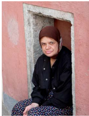
“Free but Still Poor” Tallinn, Estonia, 2005

In summary, the Brown collection epitomizes the life of a photographer with “a good eye” for composition, character, and uniqueness of subject matter... of vivid photographs well taken, and a enriched life well-lived.