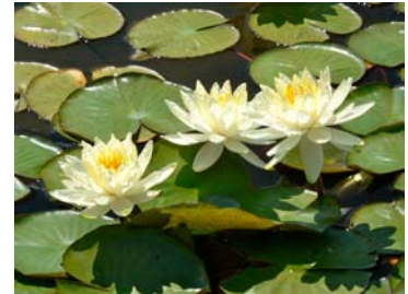
Water Lilies & Koi Pond Tokyo, Japan, 2004